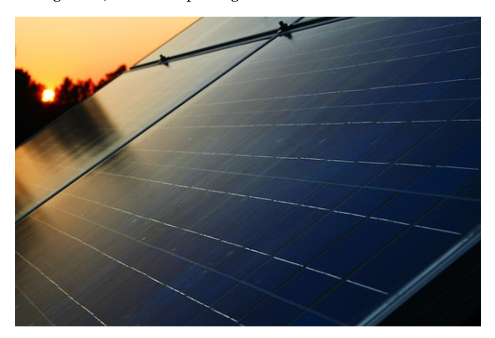
This work is licensed under a <u>Creative Commons Attribution-Share Alike</u> 3.0 United States License.

Scheer was vigorously opposed to <u>nuclear power</u> and <u>advocated</u> small scale, distributed power generation over large scale, centralised power generation schemes.