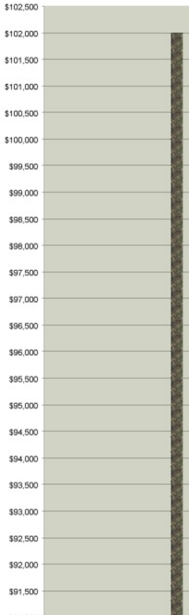
2007 United States Research and Development Investments in Different Types of Energy Compared to the Cost of the War in Iraq Figures are in Millions SCROLL DOWN

That $2,000,000,000,000? Well, that amount of money could’ve built solar thermal plants here that would have provided energy for 2/3rds of our nation’s energy demand.